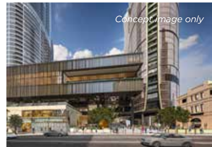
Concept image only

The multi-billion dollar Queen's Wharf Brisbane development is being delivered by Destination Brisbane Consortium – a joint venture led by The Star Entertainment Group alongside its Hong Kong-based partners, Chow Tai Fook Enterprises and Far East Consortium.