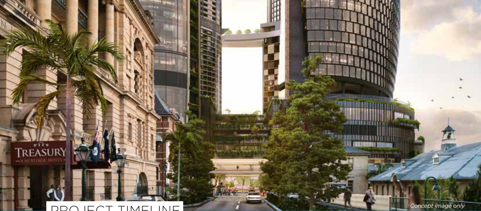
Concept image only