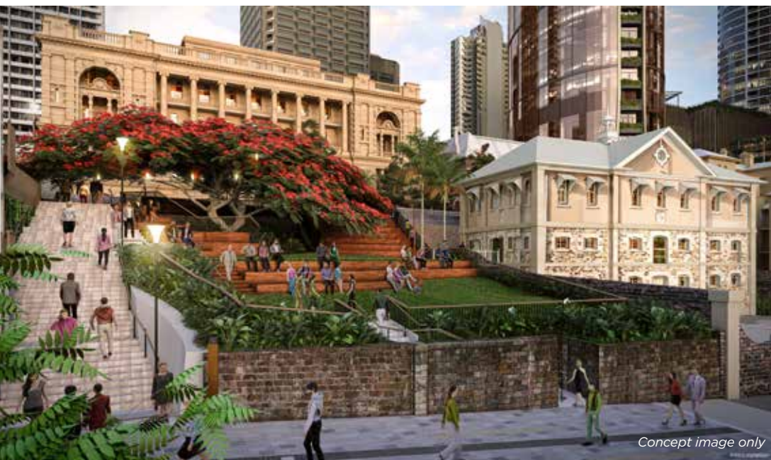
Concept image only