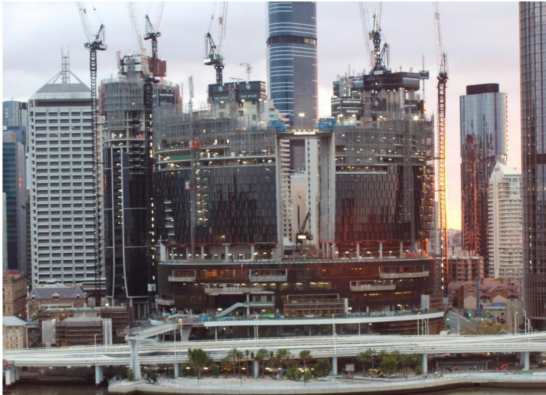
Image: Sky Deck platform in place