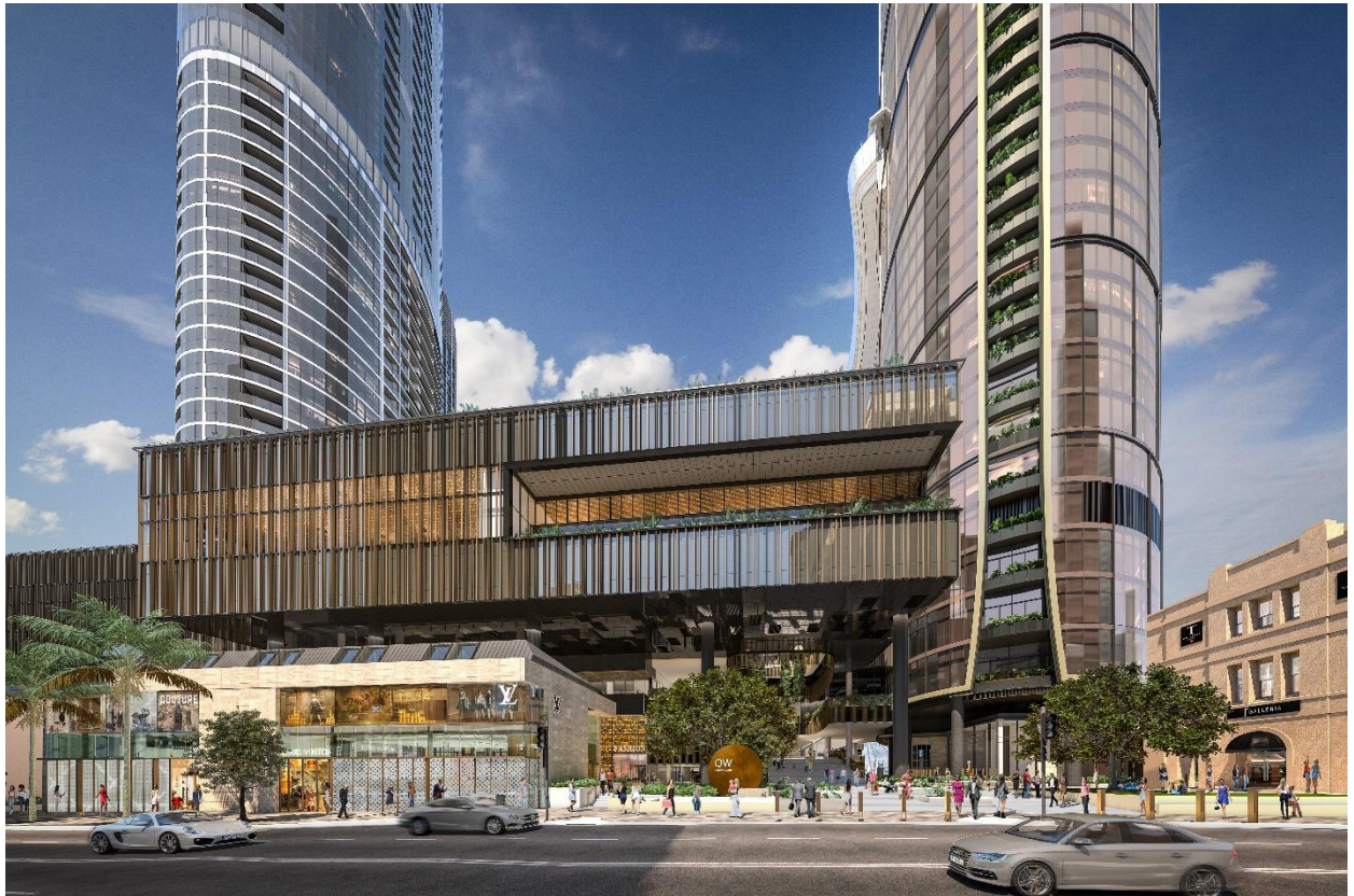
Image: QWB George Street entry with DFS Luxe Boxes (left) and DFS T Galleria emporium at the Printery (right).