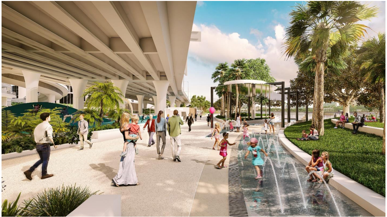
Concept image: The Landing and public space under the Riverside Expressway