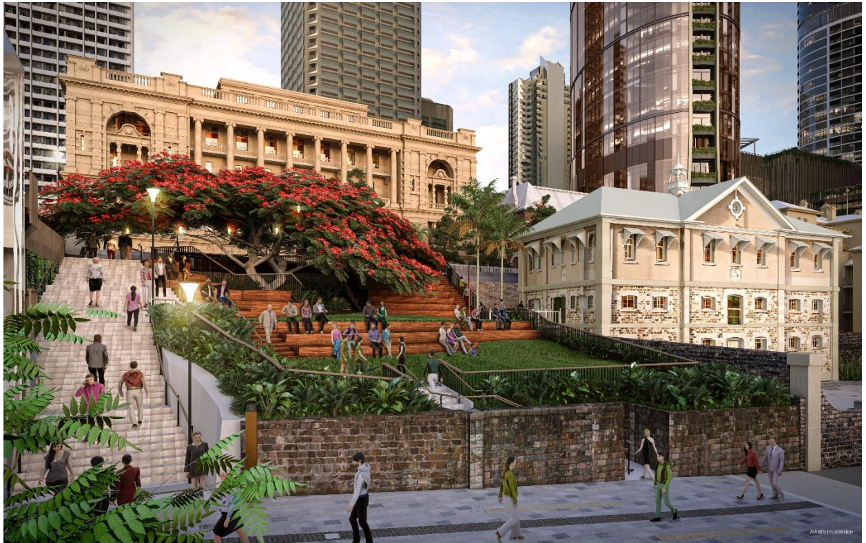
Concept image: Rejuvenated Miller Park