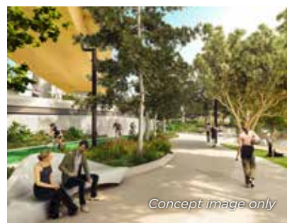
Concept image only

To enable this construction to occur the bikeway will be temporarily closed from the Goodwill Bridge through to the back of 1 William Street (near the old ferry terminal no longer in use) for approximately 12 months. Working closely with traffic authorities, government stakeholders, QUT and near neighbours, a safe alternative temporary diversion will be in place from July 2018.