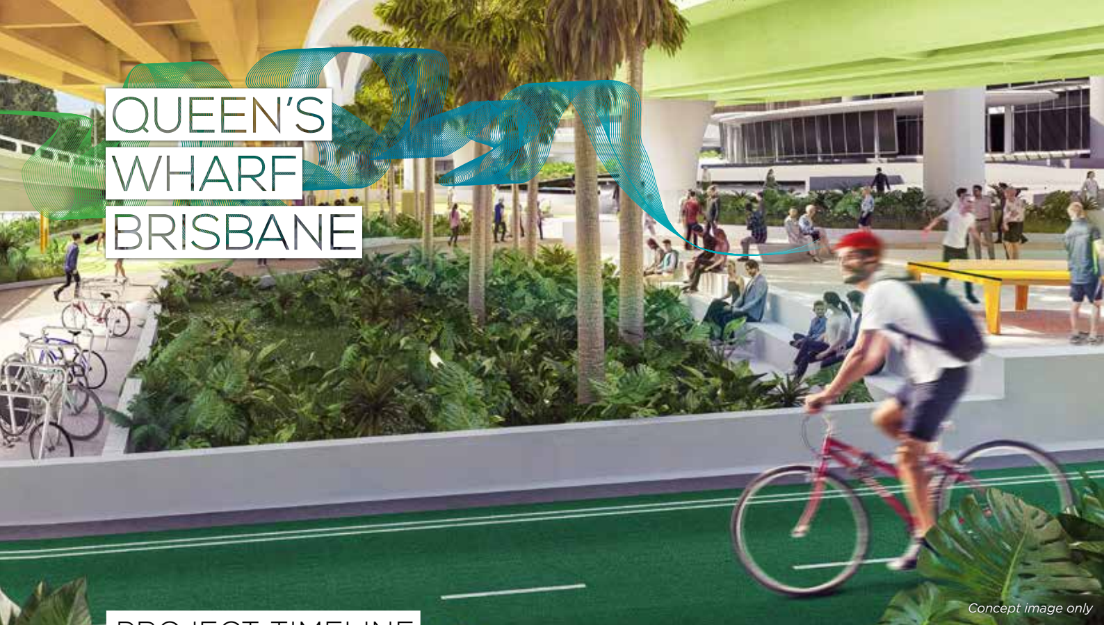
Concept image only